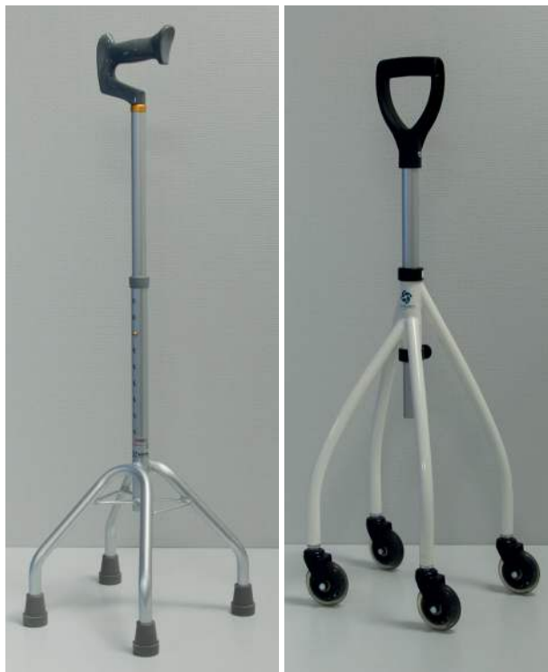
Fig. 2 Quadripod cane.

All of the participants benefited from a short (few minutes) training session performed by the physical therapist involved in the study to familiarize themselves with the rolling cane. The rolling cane Wheelleo® is a new device. It weighs 2.7 kg and the height can be adapted from 74 to 98 cm. Before starting the experiment, the global neurological impairments were assessed using the Stroke Impairment Assessment Set (SIAS) (9). The resting heart rate (RHR), in beats per min (bpm), and the presence of beta-blocker medication were also monitored. During each session (with the quadripod cane (Fig. 2) or rolling cane (Fig. 3)),